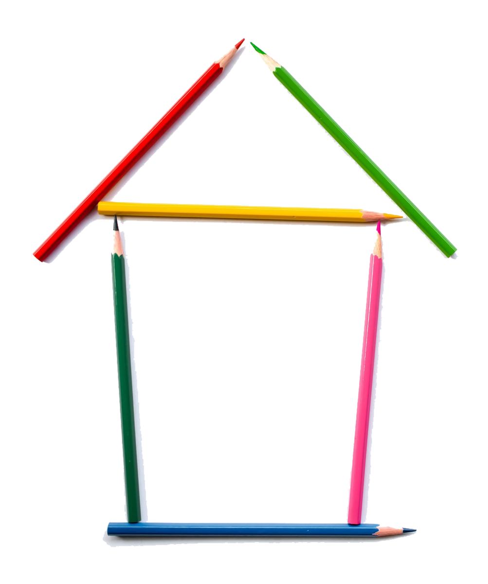
Year 8 Home Learning Curriculum Guide 2021